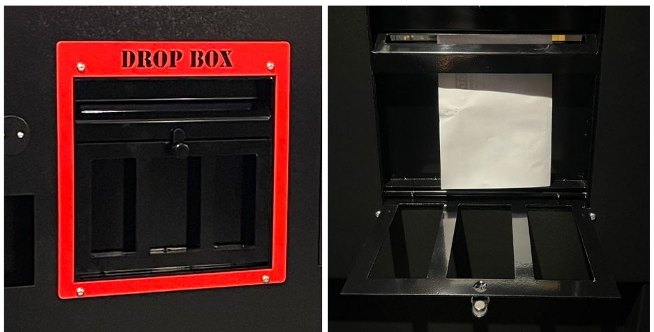
EXTERNAL DOOR WITH PAPERWORK TRANSFER BOX