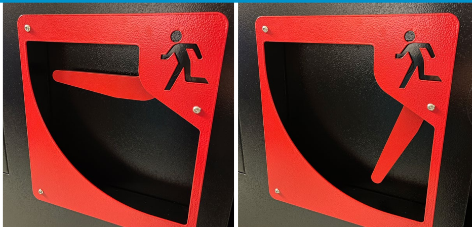
INTERNAL DOOR WITH EMERGENCY EXIT OVERRIDE HANDLE